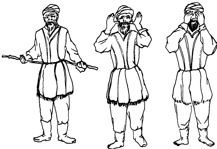
FIGURE 4. Positions of Imam Kharaman, the two to the right indicating prayer