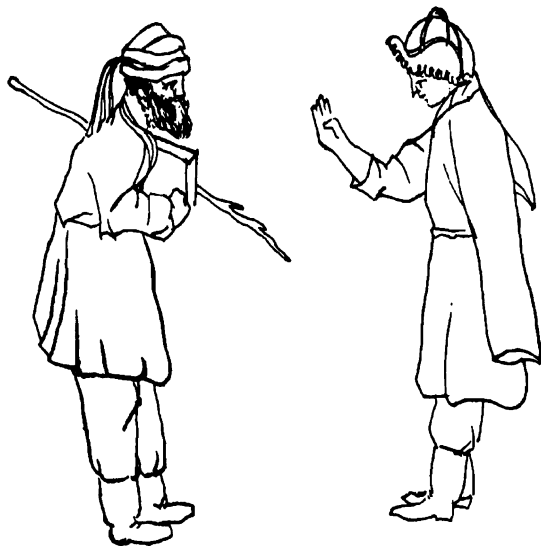
FIGURE 3. The Mongol politely greeting Imam Kharaman